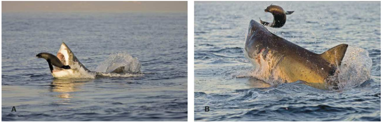
Figure 2. If a seal is not killed or disabled in the initial strike by an attacking shark, the seal has tactical advantages in terms of reduced turning radius. In both (A) and (B), a highly manoeuvrable seal evades an attacking shark during its secondary pursuit.

predicts a white shark should launch an attack below a minimum depth of 7 m in order to remain undetected while stalking seals from below, with enough vertical distance to build up momentum required for launching a vertical strike at the surface. At Seal Island, sharks patrol the waters at average depths of 12–14 m; however, attacks occur over a depth range of ~7–31 m, with significantly higher frequency of attacks occurring over depths of 26–30 m.